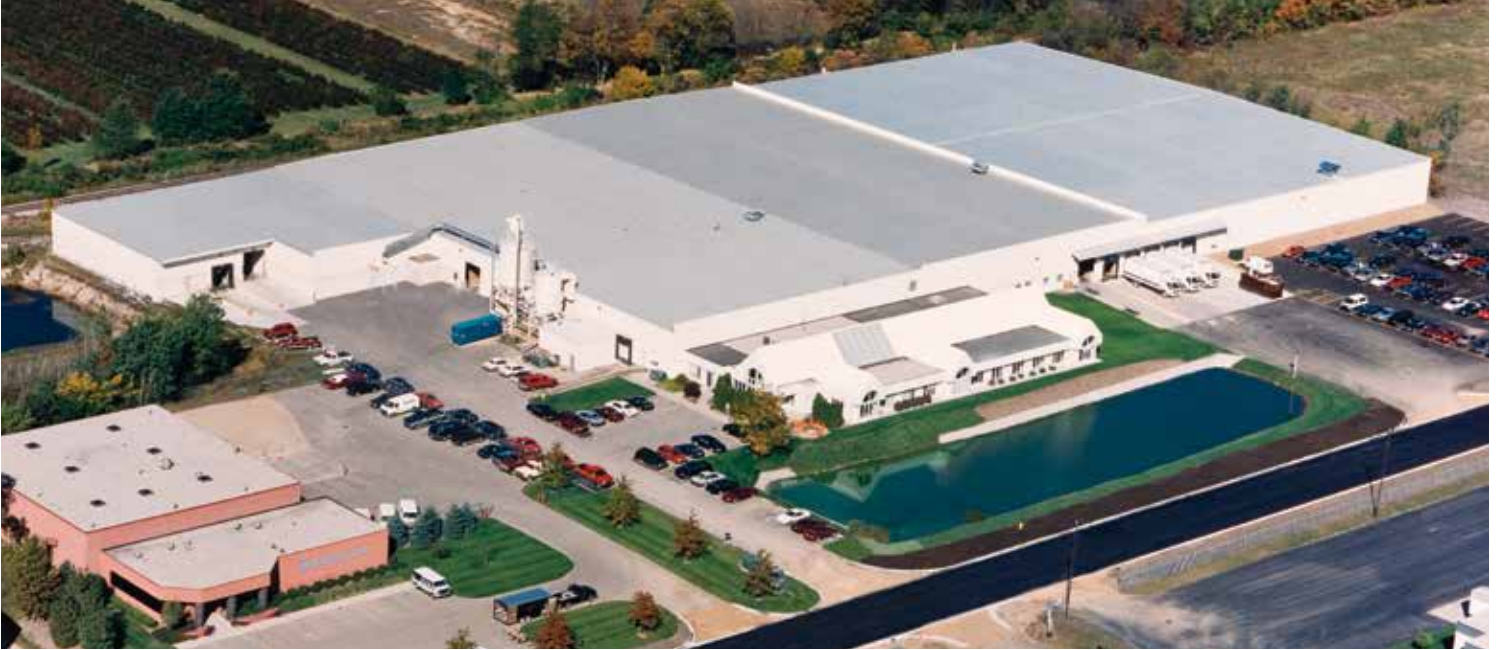
Holland, MI Facility

Ready to serve you: Seasoned professionals and a highly experienced manufacturing team based in the USA.