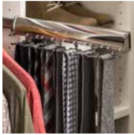
Slide-out Tie Rack