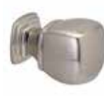
Luxe Cube Matte Nickel