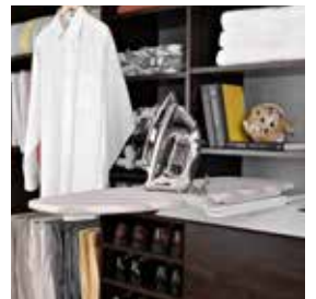
Fold-out Ironing Board