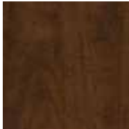
Espresso Lustre Finish