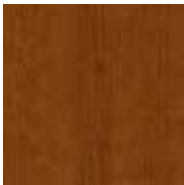
Chestnut Lustre Finish