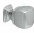
Luxe Cube Polished Chrome