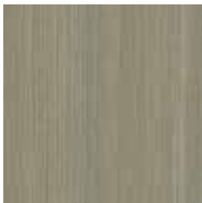
Driftwood Natural Finish