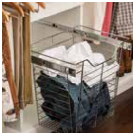
Slide-out Wire Baskets