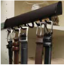
Slide-out Belt Rack

Discover must-haves that take organization to the next level.