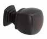
Luxe Cube Oil-Rubbed Bronze