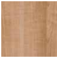
Chateau Smooth Finish