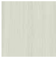
Desert Natural Finish