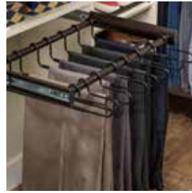
Slide-out Pant Rack