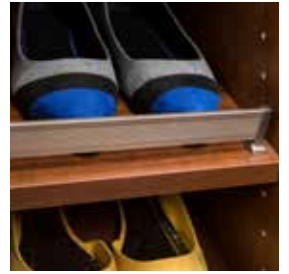
Slanted Shoe Shelves