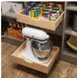
Scoop Front Drawer