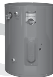
6, 10, 15, 19.9 and 30-Gallon

Professional Classic Point-of-Use 2.5, 6, 10, 15, 19.9 and 30-Gallon Capacities 120 Volt AC 2-Wire Single Phase Electric