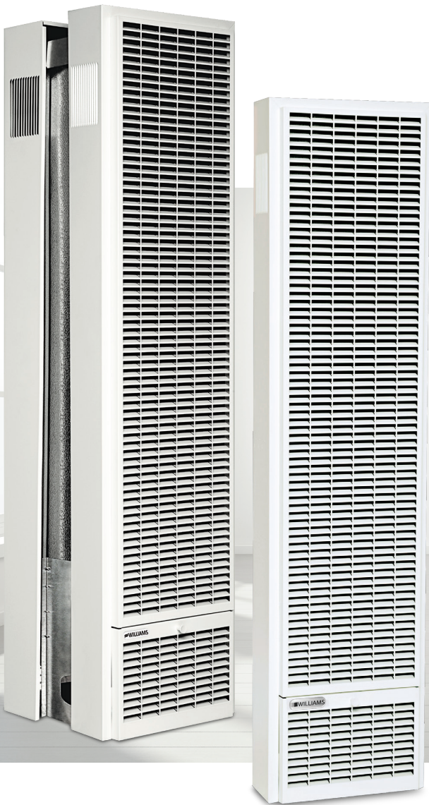
DUAL-WALL TOP-VENT 50,000 BTU/hr.