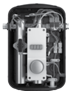
RTEX-08, RTEX-11, RTEX-13